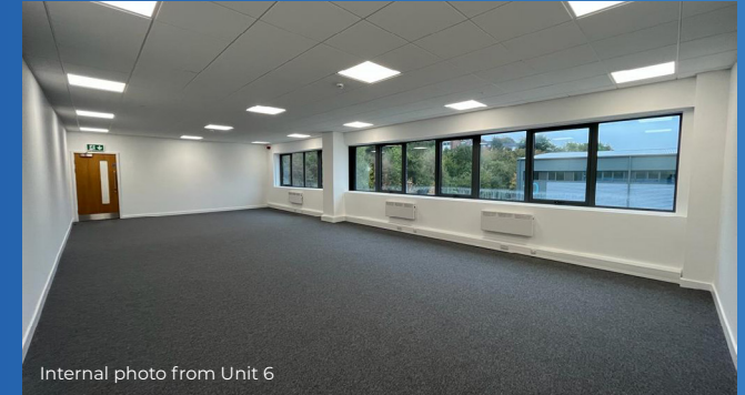
Internal photo from Unit 6

Unit 1 and Unit 6 both benefit from fully fitted first floor mezzanine accommodation to include LED lighting, carpeted and heated office space.