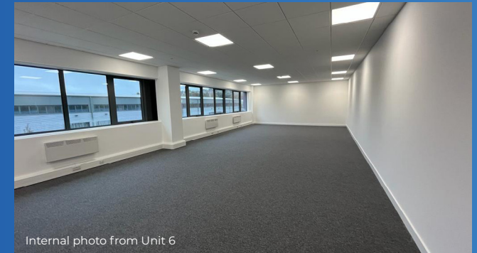
Internal photo from Unit 6